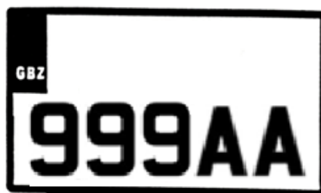
DIAGRAM 2 (MAXIMUM 5 CHARACTERS)