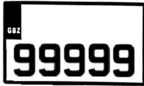
DIAGRAM 2 (MAXIMUM 5 NUMBERS)