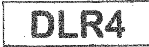
DIAGRAM 7 (Dealer Licence Plates)